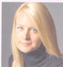
the working mom